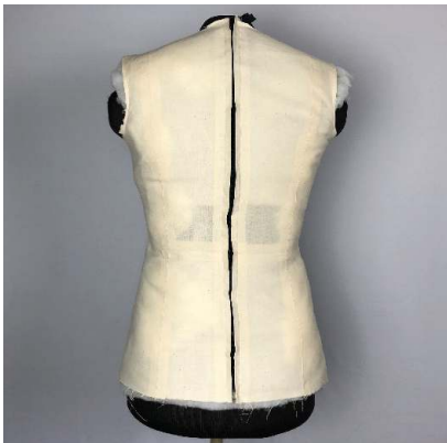
Step 16: At the end, your moulage should be snug but still zip up in the back.