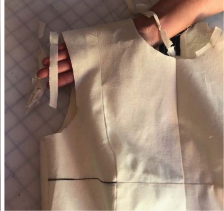
Step 12: When you've finished padding the mannequin, mark & cut the seam allowances off the neckline and armholes of your moulage. Iron the armhole area, to shrink back the bias parts of the armhole.