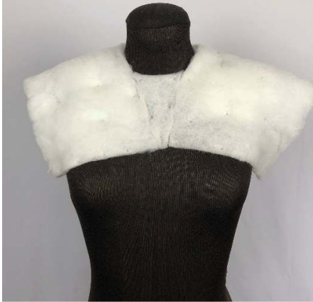
Step 10: Keep using pins as you go to keep the batting firm. If they layers don't look symmetrical, try to even them out. Once you've finished padding a section, cut off the excess sticking out past the mannequin.