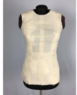
Step 18: To finish the moulage, you can add panels over the armholes (I sewed a brown fabric over mine to hide the stuffing layers). Now you're finished! YAY! You have a dress form that is perfect for your body. Great work! :)