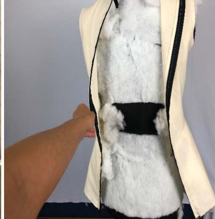
Step 14: Put your moulage on the mannequin and begin padding/stuffing any areas that are still loose.