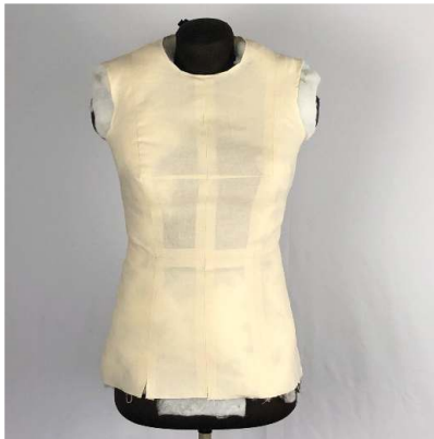
Step 17: If you have any excess batting sticking out, you can trim it down or stuff it in. After seeing the moulage on the mannequin, you may decide you want it to be longer. To extend the moulage, just add a panel of a couple inches to the hem.