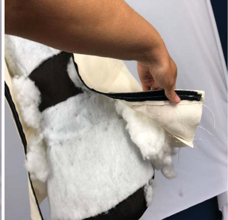
Step 15: At this stage, it's okay to leave this stuffing loose (i.e. without pins). This final layer is just to fill out the mannequin nicely and give a taut form to the moulage. You'll likely need to stuff a lot to aet it tight.