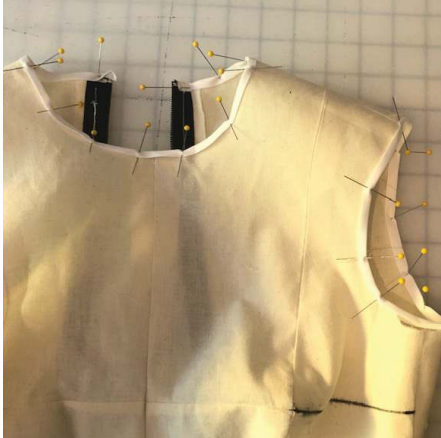
Step 13: Sew on a pre-finished bias binding along the armhole and neckline. Slightly stretch your bias binding in the area of the upper armhole where the bias is. The neck & armholes should be clean finished.