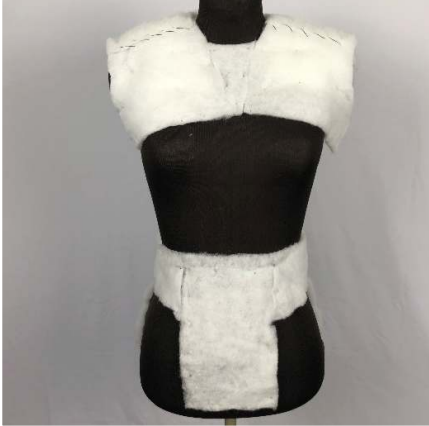
Step 11: Continue filling in loose areas with the previous steps: layer stuffing, pin, and baste. You may not be able to fill in every loose area with batting. Don't worry! Just get it as close as you can.